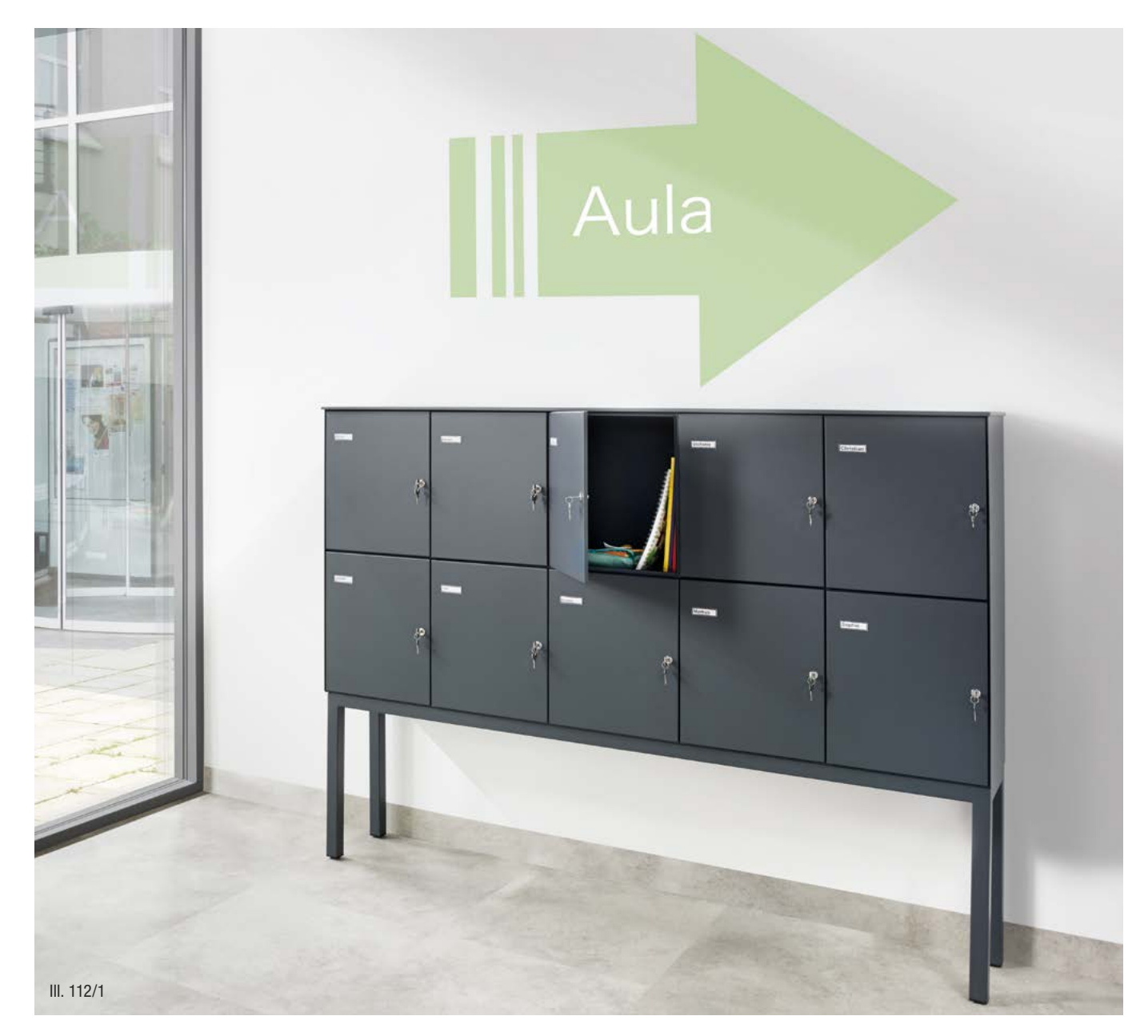
Economy Class safety deposit system freestanding compartment with reinforced cylinder cam lock rear wall tight-fitting panelling Classic 20 on table stand

Our safety deposit systems are produced in accordance with customer requests and requirements to ensure the highest quality and flexibility. The box dimensions and sizes of the required systems are custom-made. As our customer, you can choose from a wide range of standard formats and panels, as well as have a custom system produced to meet your exclusive demands. From the simple coin-deposit lock to security code locks through to the integrated, electronic, application-controlled solution, there is nothing impossible for JU. Get in touch for custom advice. Below you will find a selection of product examples.