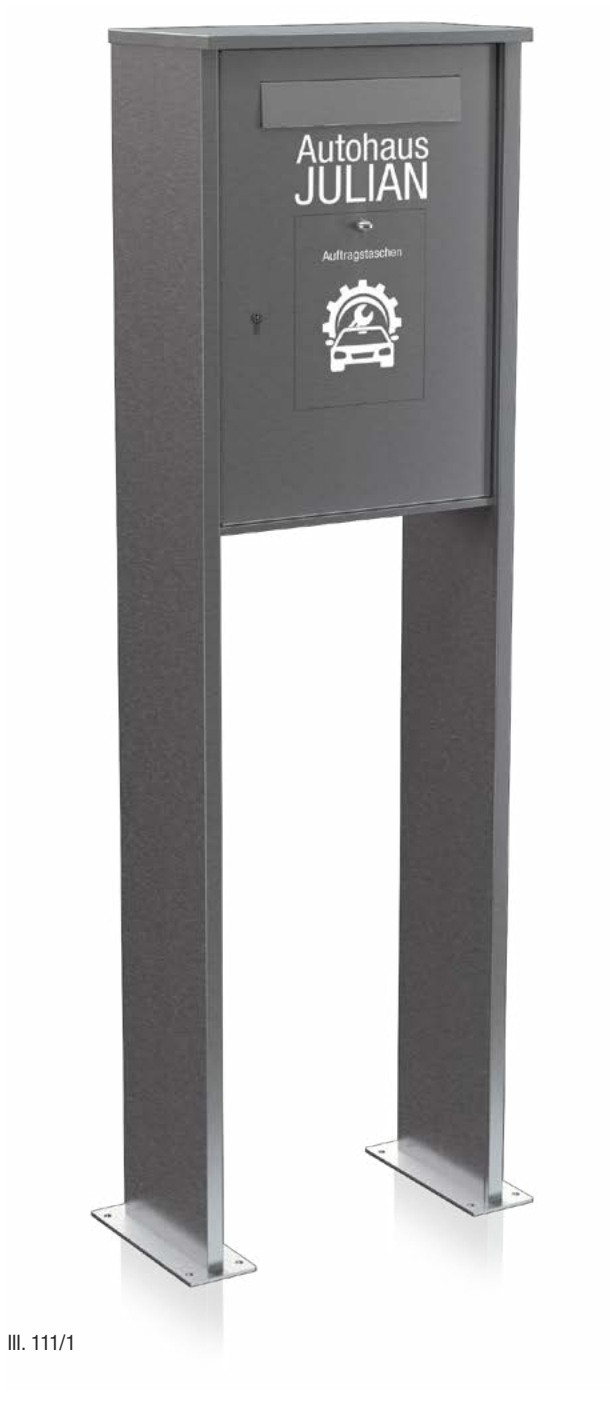
Business Class car dealership mailbox, freestanding with compartment for order bags reinforced 24 mm door with three-point lock profile cylinder lamella protection device Nova 40 panelling continuing as stand 22-321 with base plates engraving as specified

Benefit from our know-how in the field of custom-made solutions. We also recommend a JU-Safety Class system for car dealerships. Combined with a three-point lock, you get additional protection for vehicle papers or keys, which is taken out from reputed insurance companies. Just give us a call.